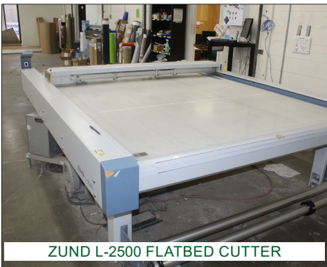
ZUND L-2500 FLATBED CUTTER