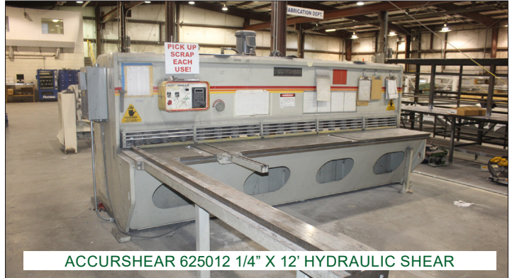
ACCUR SHEAR 625012 1/4" X 12' HYDRAULIC SHEAR