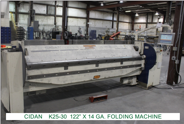
CIDAN K25-30 122" X 14 GA. FOLDING MACHINE