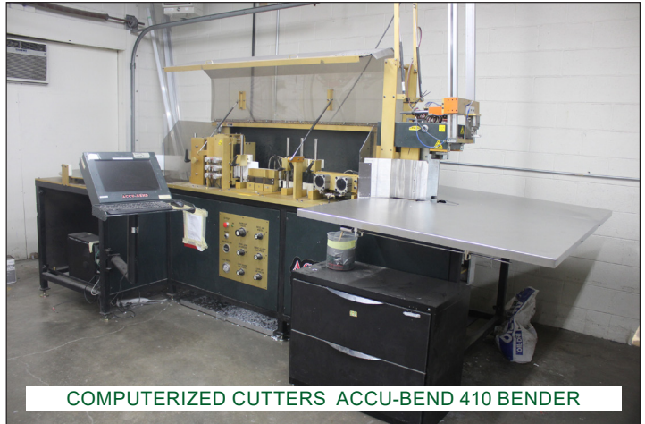
COMPUTERIZED CUTTERS ACCU-BEND 410 BENDER