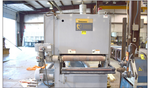
TIMESAVERS MODEL 137-1 HPMS 37" WIDE BELT DEBURRING & GRAINING MACHINE S/N 25562M: