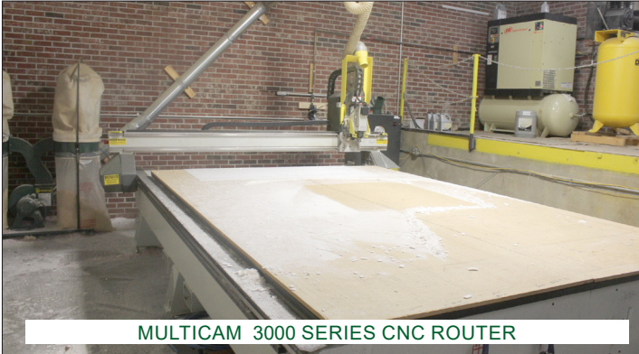
MULTICAM 3000 SERIES CNC ROUTER

Preview / Inspection: Monday, November 30, 8 AM - 3 PM Asset Location: 334 Industrial Park Road, Bluefield, VA