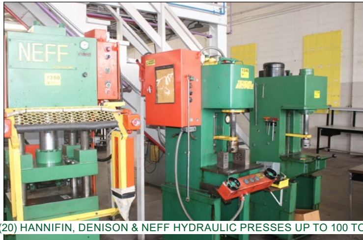
(20) HANNIFIN, DENISON & NEFF HYDRAULIC PRESSES UP TO 100 TON