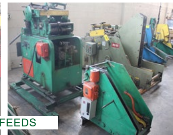
COIL REELS, STRAIGHTENERS & FEEDS