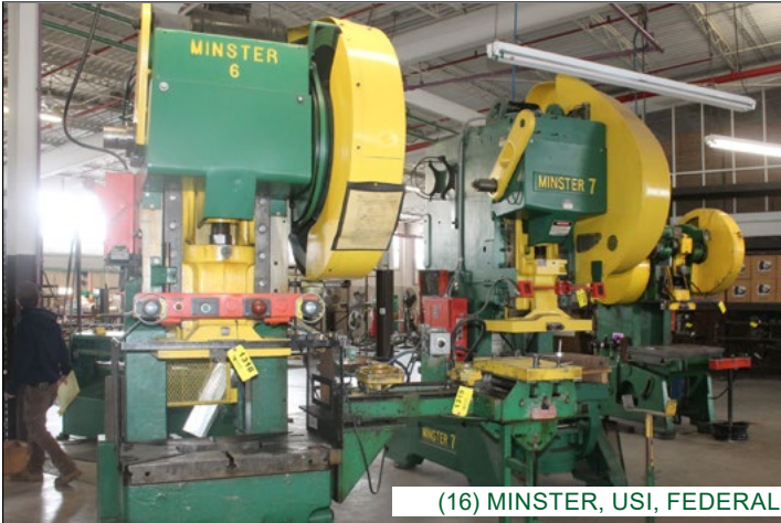
(16) MINSTER, USI, FEDERAL & L&J PRESSES UP TO 110 TON