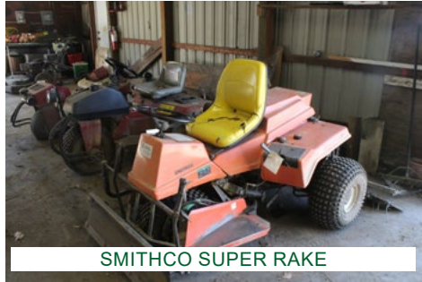
SMITHCO SUPER RAKE