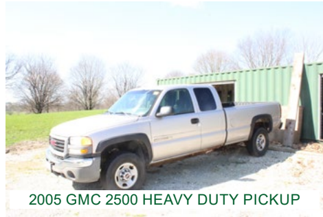
2005 GMC 2500 HEAVY DUTY PICKUP