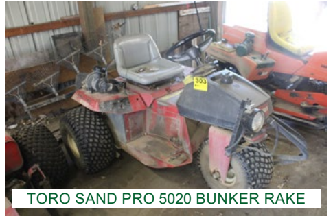
TORO SAND PRO 5020 BUNKER RAKE