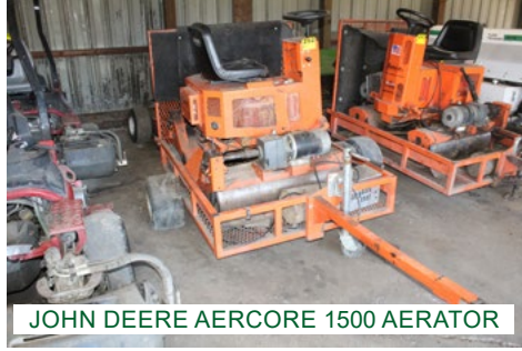
JOHN DEERE AERcore 1500 AERATOR