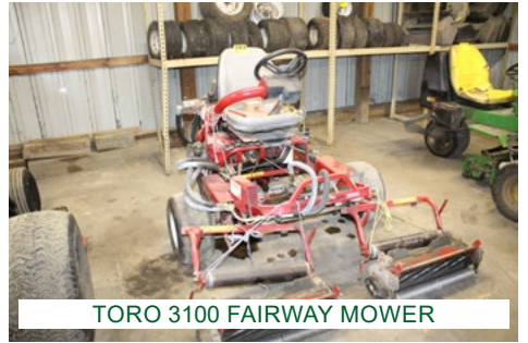
TORO 3100 FAIRWAY MOWER