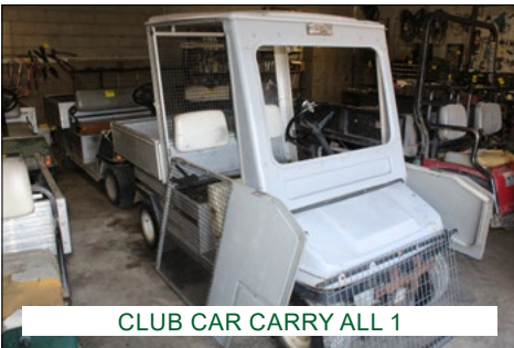
CLUB CAR CARRY ALL 1