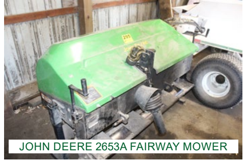
JOHN DEERE 2653A FAIRWAY MOWER