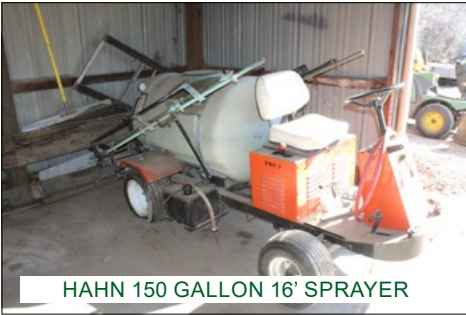
HAHN 150 GALLON 16' SPRAYER