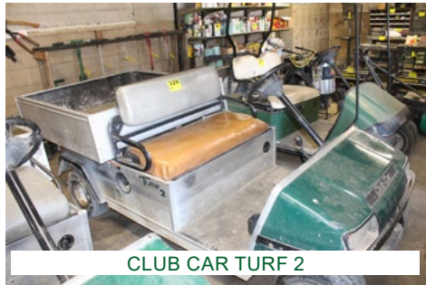
CLUB CAR TURF 2