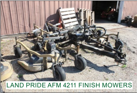
LAND PRIDE AFM 4211 FINISH MOWERS