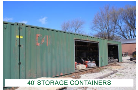
40' STORAGE CONTAINERS