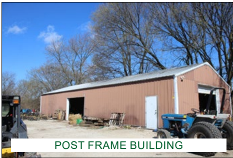
POST FRAME BUILDING