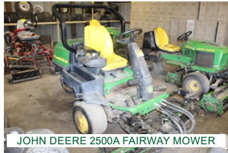
JOHN DEERE 2500A FAIRWAY MOWER