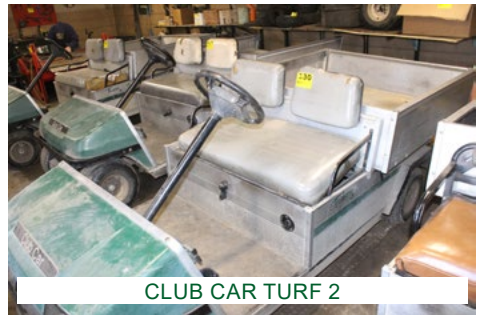
CLUB CAR TURF 2