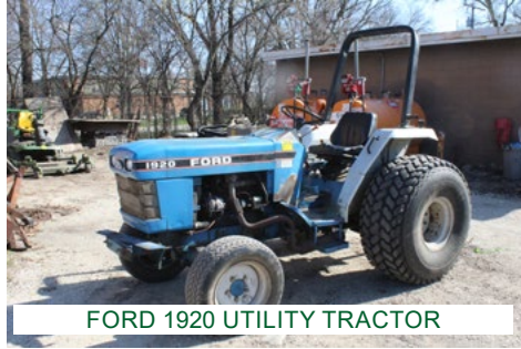
FORD 1920 UTILITY TRACTOR