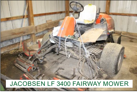
JACOBSEN LF 3400 FAIRWAY MOWER