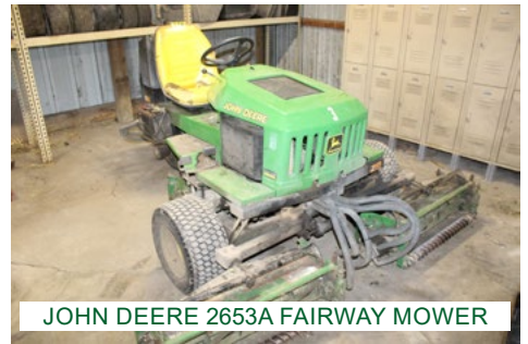
JOHN DEERE 2653A FAIRWAY MOWER